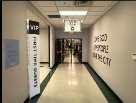
Suite 150: Office