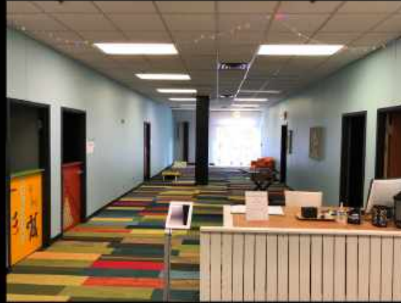
Suite 150: Reception