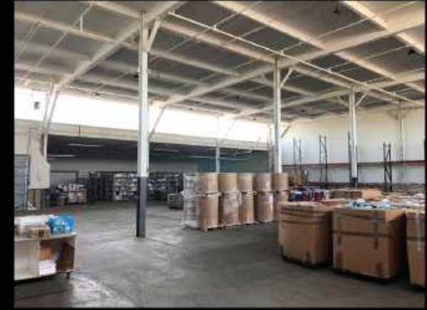
Suite 130: Warehouse