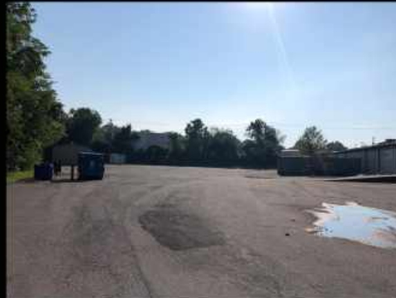
Truck Court/Outside Storage