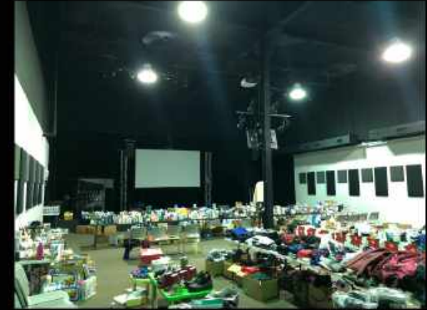
Suite 150: Warehouse