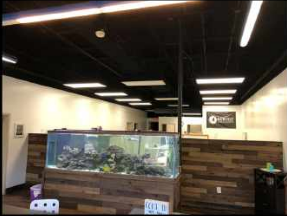
Suite 130: Reception