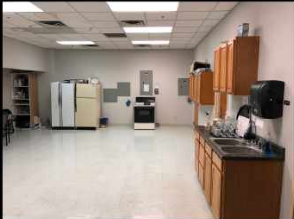
Suite 150: Breakroom