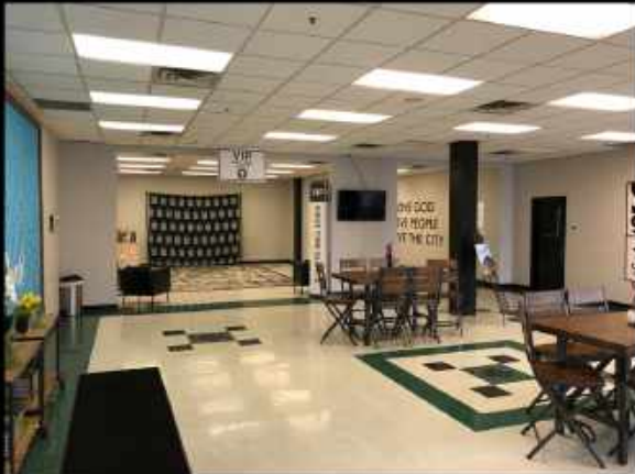
Suite 150: Reception