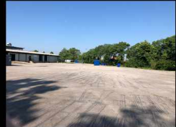
Truck Court/Outside Storage