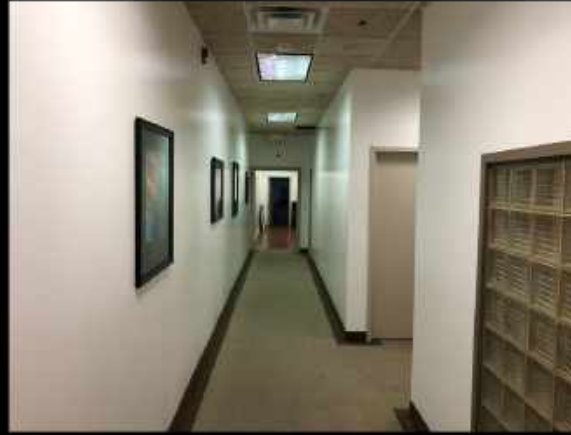
Suite 130: Office