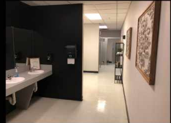
Suite 150: Restroom