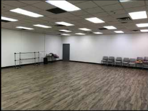
Suite 150: Office