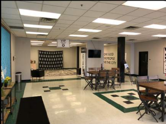
Suite 105: Reception