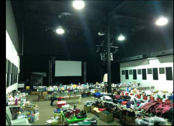
Suite 105: Warehouse