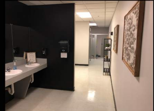
Suite 105: Restroom