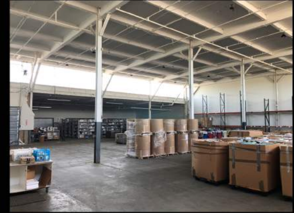
Suite 104: Warehouse