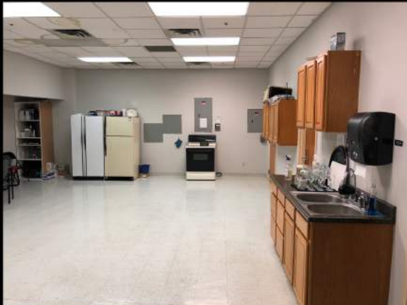
Suite 105: Breakroom