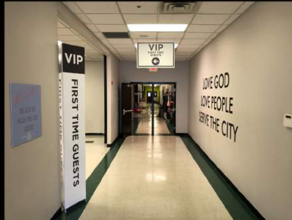
Suite 105: Office