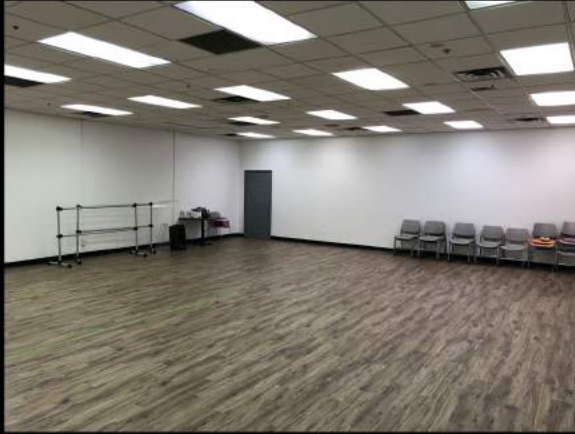
Suite 105: Office