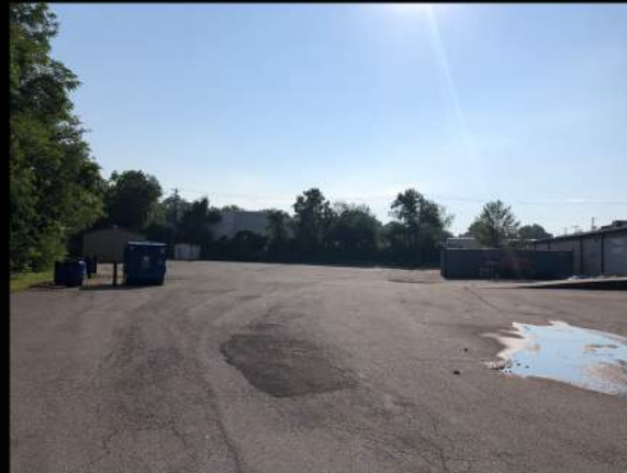
Suite 105: Truck Court/Outside Storage