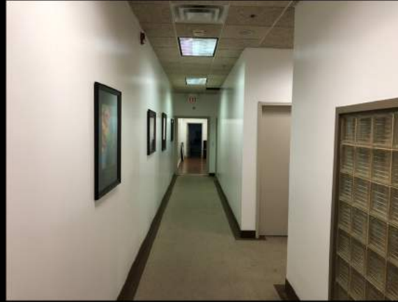
Suite 104: Office