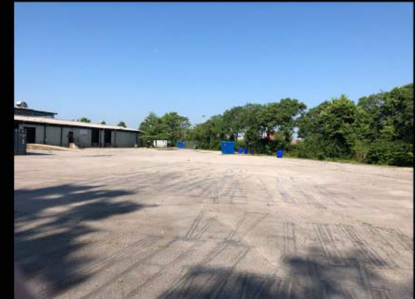
Suite 105: Truck Court/Outside Storage