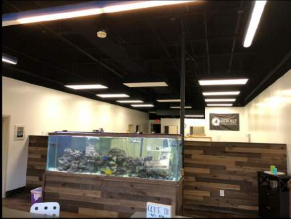
Suite 104: Reception