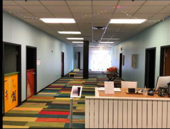
Suite 105: Reception