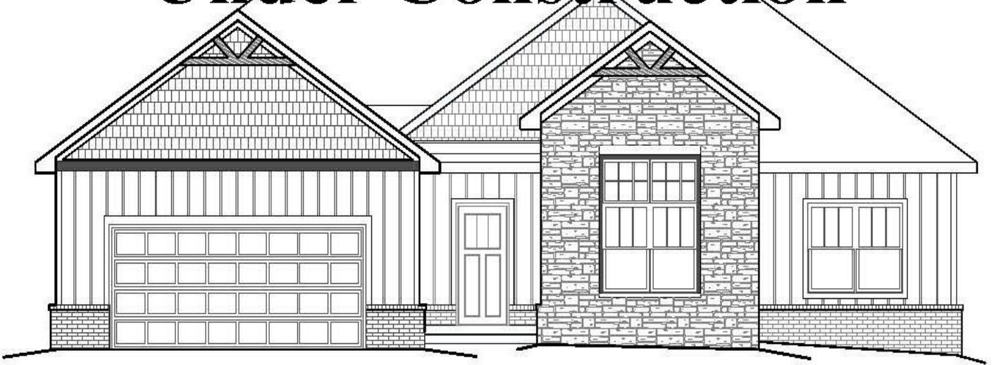
FRONT SIDE ELEVATION