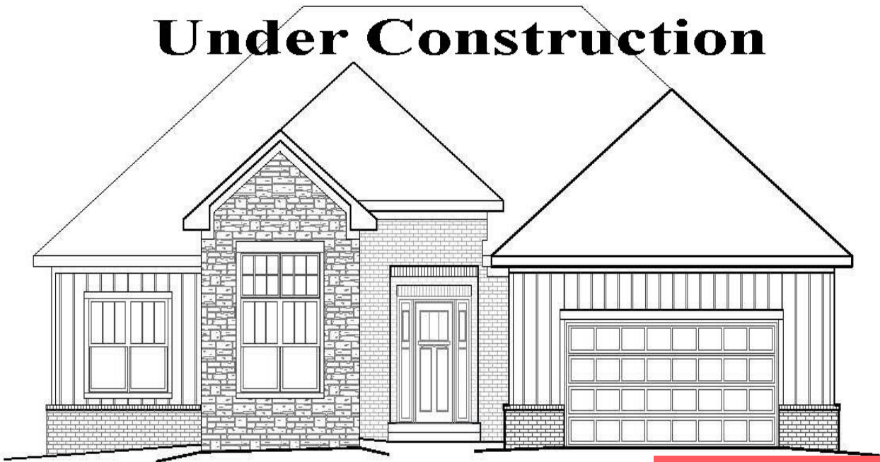
FRONT SIDE ELEVATION