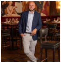
Nicholas Wolter National Real Estate