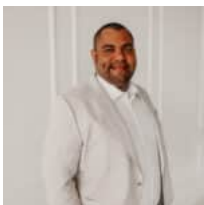
Joshua A Davis

This spacious 4-bedroom, 3-bathroom home offers a comfortable retreat on a sprawling 2.58-acre lot. With 2304 sqft of living space, including a living room and den, there's ample room for relaxation and entertaining. The detached 2-car carport provides convenient parking, while the full-length covered front porch invites you to enjoy beautiful rural views and tranquil [...]